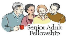
Senior Adult Fellowship

The Catholic Diocese of Lucknow comprises of 10 Civil Districts of Uttar Pradesh, the biggest and most populated State in India. The state of Uttar Pradesh is one of the most backward States in the Country. People are very poor. Many of them are below poverty line. Majority of the Catholics are also poor. The diocese helps poor children for their education by paying their fees, supplying books and uniforms, stationery, medical assistance etc. Many poor families depend on the Diocese not only for education of children but also for food, clothing and medical treatment. Many are uneducated and unemployed.