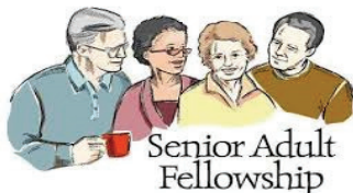
Senior Adult Fellowship

December 10 (Monday) 10 dicembre (Lunedì) 7:00 PM - 9:00 PM