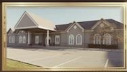
DeMarco Funeral Home Woodbridge Chapel 8888 Victoria Rd., Woodbridge, ON L4L 4S4 Phone: 416-838-9300