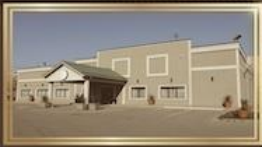
DeMarco Funeral Home Keele Chapel 7729 Keele St., Toronto, ON M3J 5N4 Phone: 416-838-9300