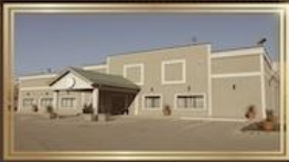
DeMarco Funeral Home Keele Chapel 7729 Keele St., Toronto, ON M3J 5K4 Phone: 416-838-9300