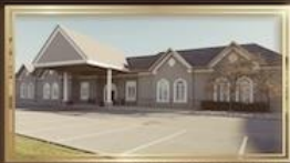
DeMarco Funeral Home Woodbridge Chapel 8888 Victoria Rd., Woodbridge, ON L4L 4S6 Phone: 416-838-9300