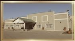
DeMarco Funeral Home Keele Chapel 3723 Keele St., Toronto, ON M3J 1K4 Phone: 416-436-7027