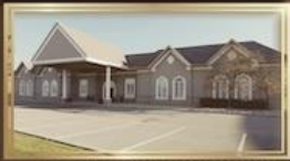
DeMarco Funeral Home Woodbridge Chapel 9688 Victoria Rd., Woodbridge, ON L4L 5K4 Phone: 905-850-4500