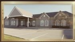
DeMarco Funeral Home Woodbridge Chapel 9688 Woodbine Rd., Woodbridge, ON L4L 5E8 Phone: 905-858-3000