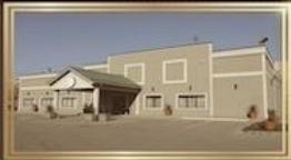
DeMarco Funeral Home Keele Chapel 3723 Keele St., Toronto, ON M3J 1N4 Phone: 416-596-3022