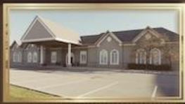
DeMarco Funeral Home Woodbridge Chapel 9688 Woodbine Rd., Woodbridge, ON L4L 6E8 Phone: 905-858-3000