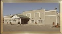
DeMarco Funeral Home Keele Chapel 3723 Keele St., Toronto, ON M3J 1N4 Phone: 416-596-3022