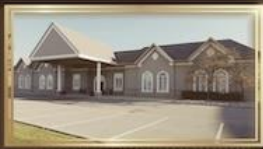
DeMarco Funeral Home Woodbridge Chapel 8000 Woodbine Rd., Woodbridge, ON L4L 6E8 Phone: 905-858-3000