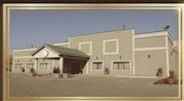
DeMarco Funeral Home, North Chapel 7739 Keele St., Toronto, ON M3J 1N4 Phone: 416-630-7027