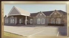
DeMarco Funeral Home, Woodbridge Chapel 8888 Weston Rd., Woodbridge, ON L4L 6K4 Phone: 905-850-9100