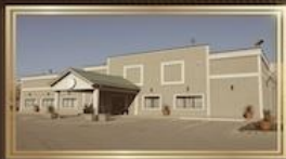
DeMarco Funeral Home Keele Chapel 3723 Keele St., Toronto, ON M3J 1Y4 Phone: 416-498-5027