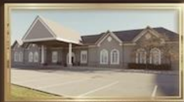
DeMarco Funeral Home Woodbridge Chapel 1800 Victoria Rd., Woodbridge, ON L4L 0E4 Phone: 905-858-9300