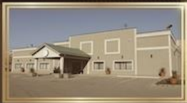
DeMarco Funeral Home Keele Chapel 7729 Keele St., Toronto, ON M3J 5H4 Phone: 416-838-9300