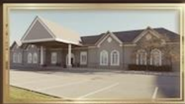
DeMarco Funeral Home Woodbridge Chapel 8888 Victoria Rd., Woodbridge, ON L4L 4S4 Phone: 416-838-9300