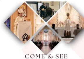
COME & SEE WEEKEND DISCERNMENT RETREAT AT ST. AUGUSTINE'S SEMINARY FOR SINGLE MEN AGES 18+

According to the Archdiocese of Toronto, all couples must contact their parish at least a year before their wedding because marriage in the Church is a sacred sacrament.