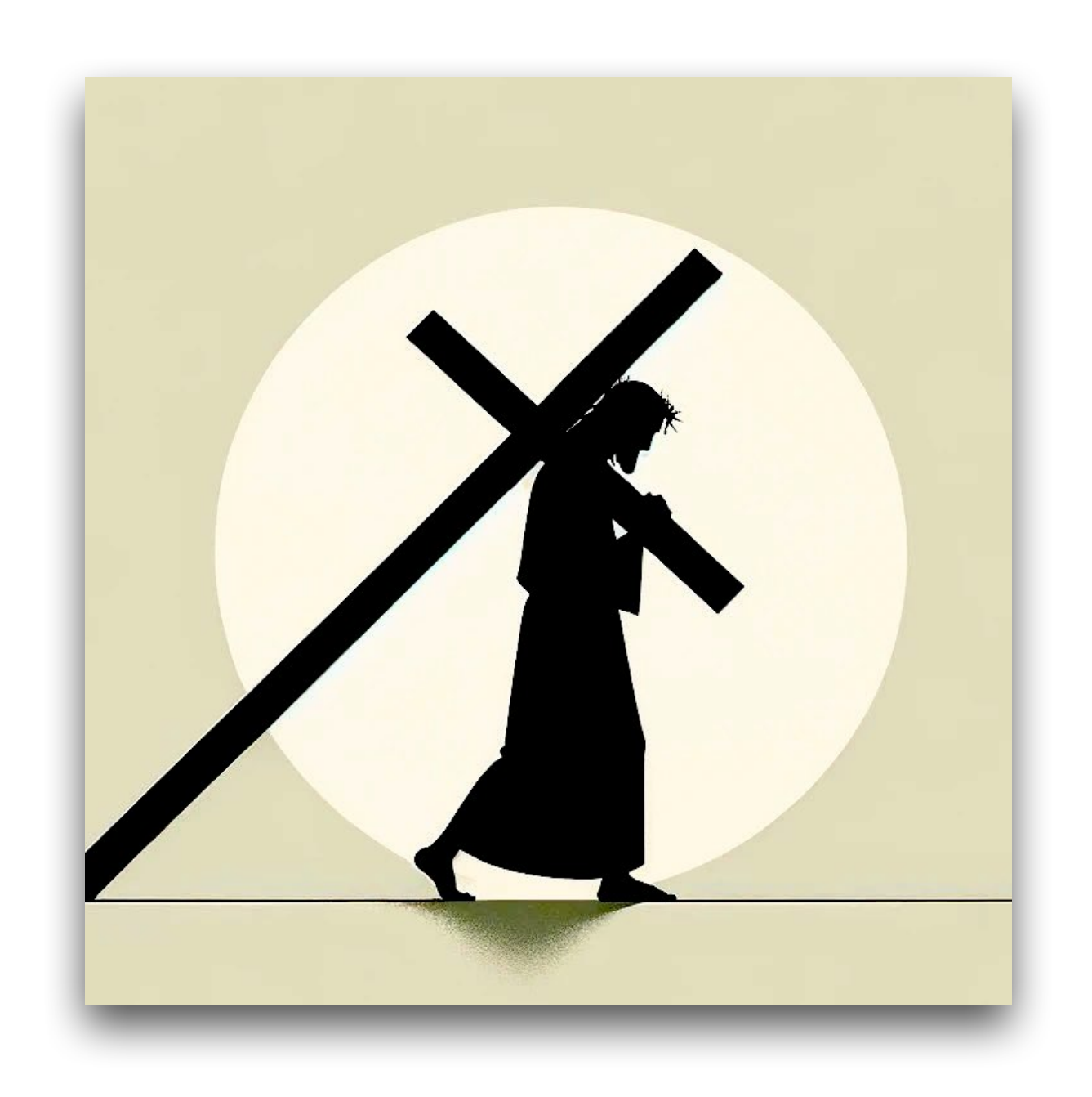
STATIONS OF THE CROSS by St. Alphonsus M. Liguori